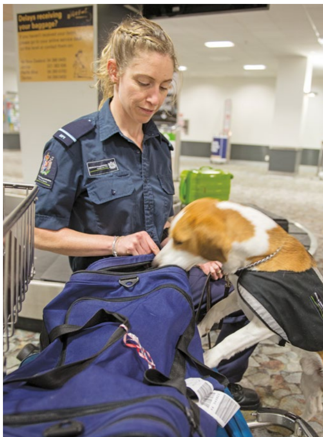
Detector dog demonstration.