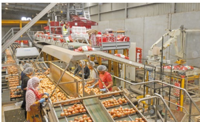
Onions NZ hosted a tour of sector operations for government officials.