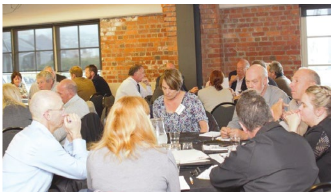
Primary industry representatives attending the GIA Mandate Forum in Wellington, October 2015.

This meeting was a valuable first step for MPI in exploring its commitment as a GIA Signatory to provide a mechanism for the other GIA partners to be actively involved in managing biosecurity risk across the wider biosecurity system.